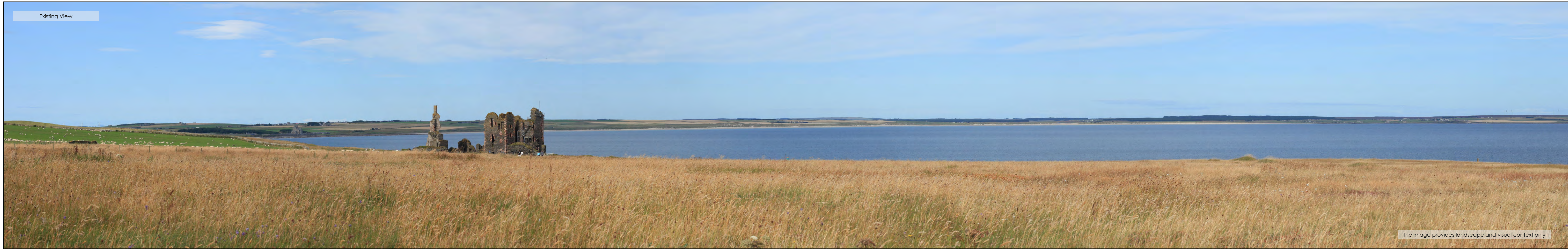
The image provides landscape and visual context only