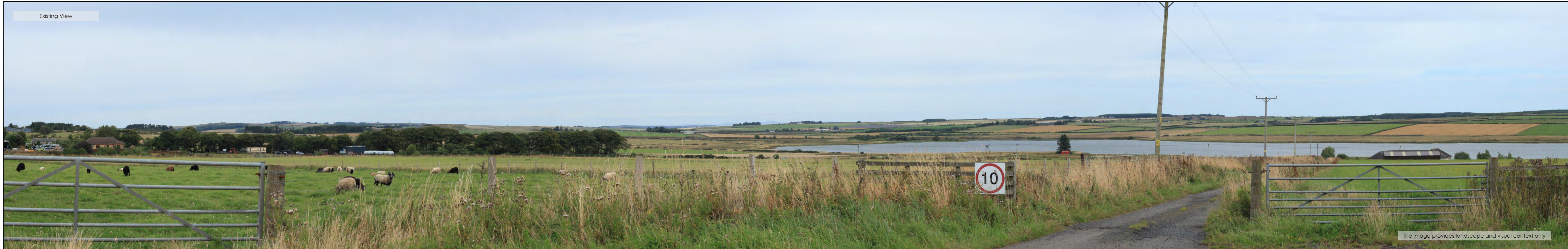
The image provides landscape and visual context only