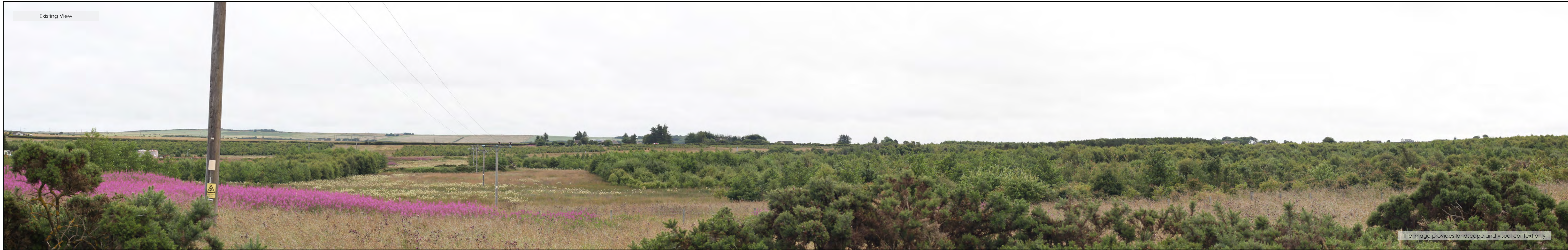
The image provides landscape and visual context only