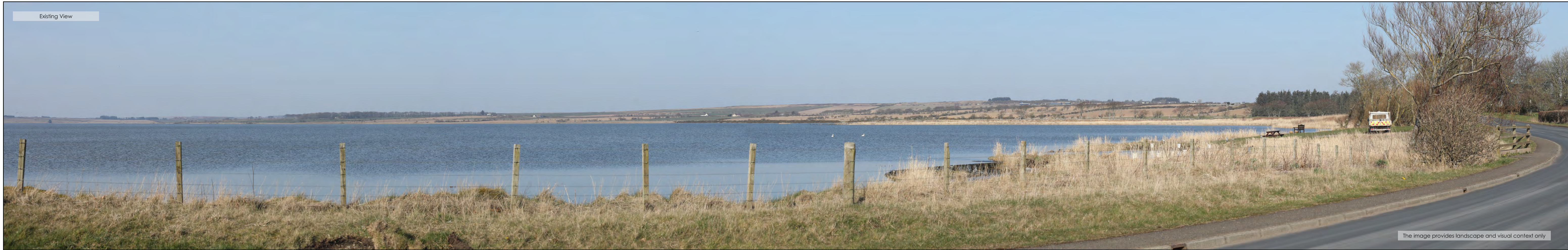
The image provides landscape and visual context only