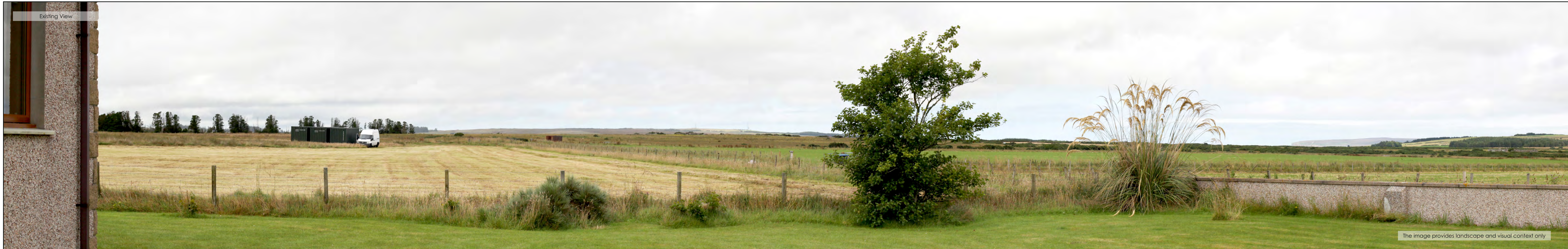
The image provides landscape and visual context only