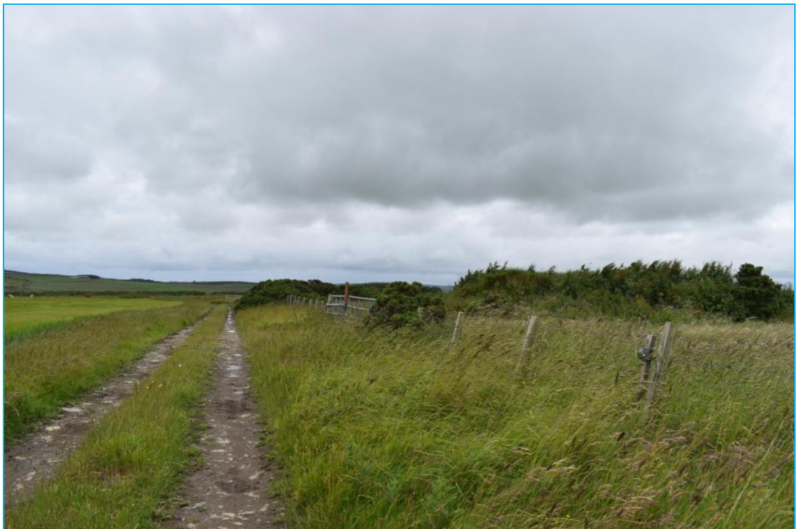
Plate 10-2-8: View northwest over Turbine 1 location