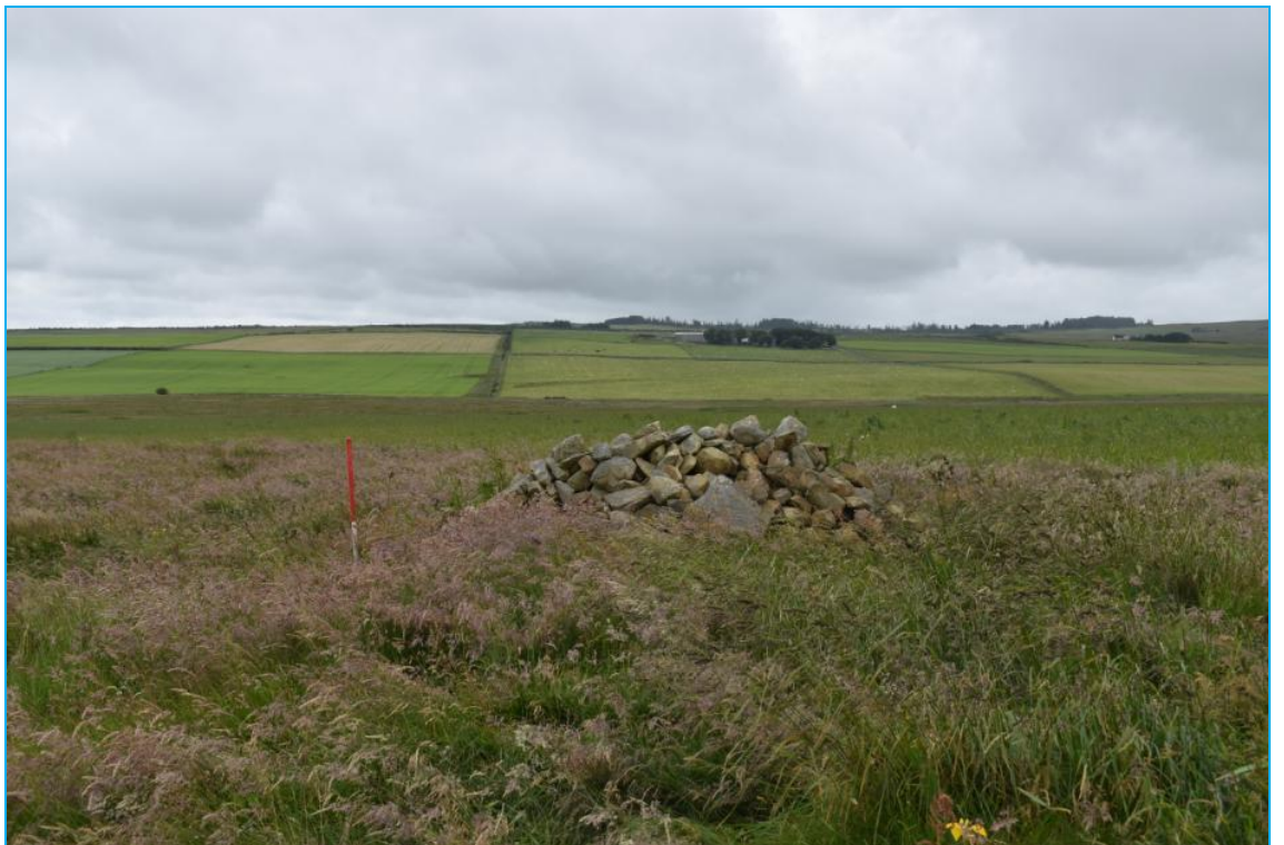
Plate 10-2-20: Clearance cairn (Asset 109), facing southwest