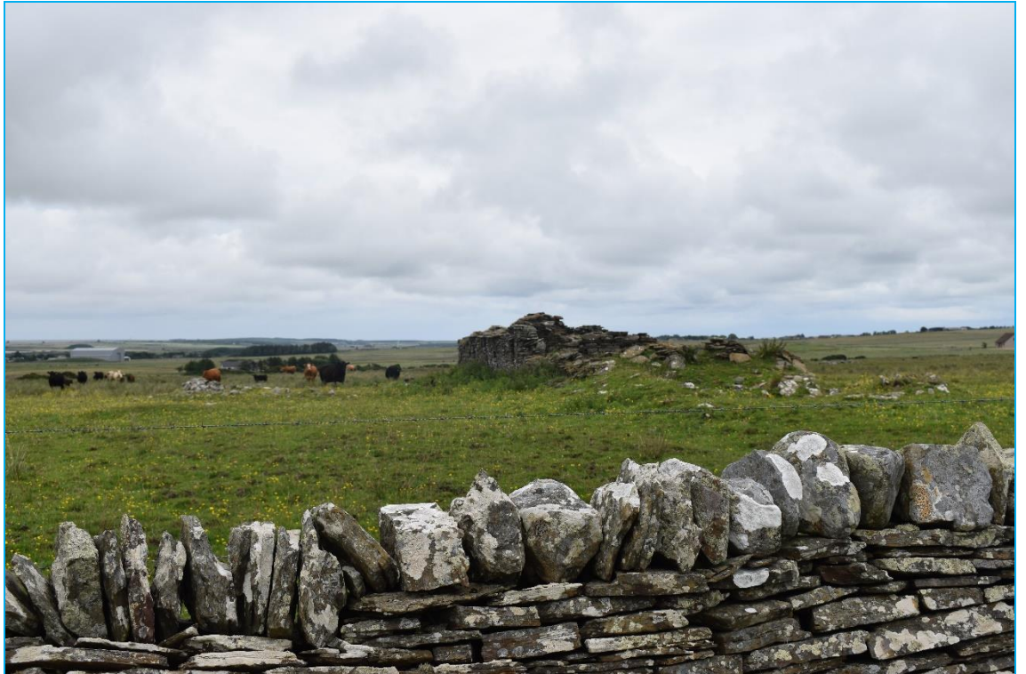
Plate 10-2-15: Ruinous building, part of Swarclett settlement (Asset 70), immediately outwith Proposed Development Site boundary, facing southeast