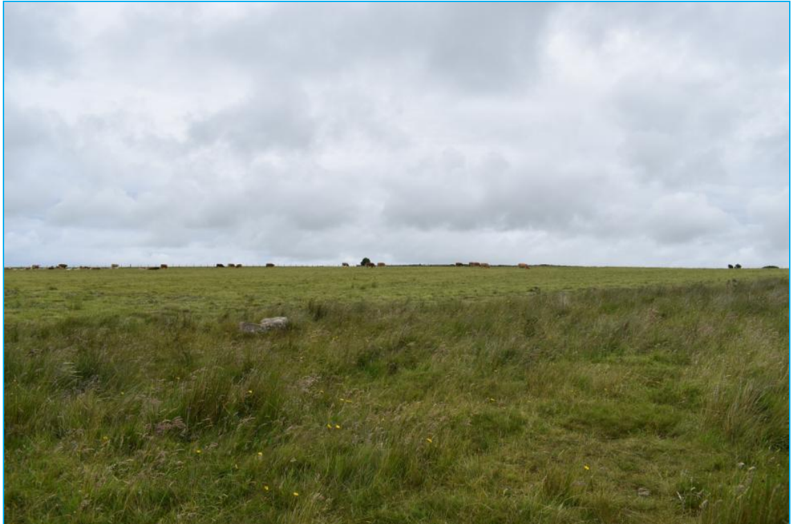
Plate 10-2-17: View northwest to Turbine 2 location, Swarclett (Asset 70) beyond