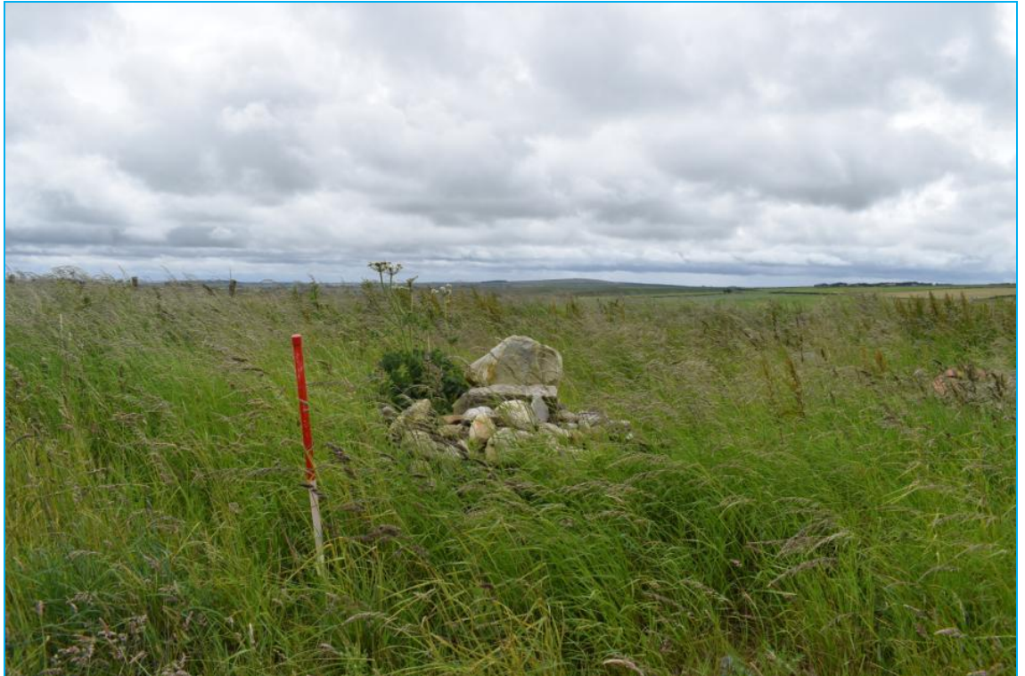
Plate 10-2-5: Small clearance cairn, facing west