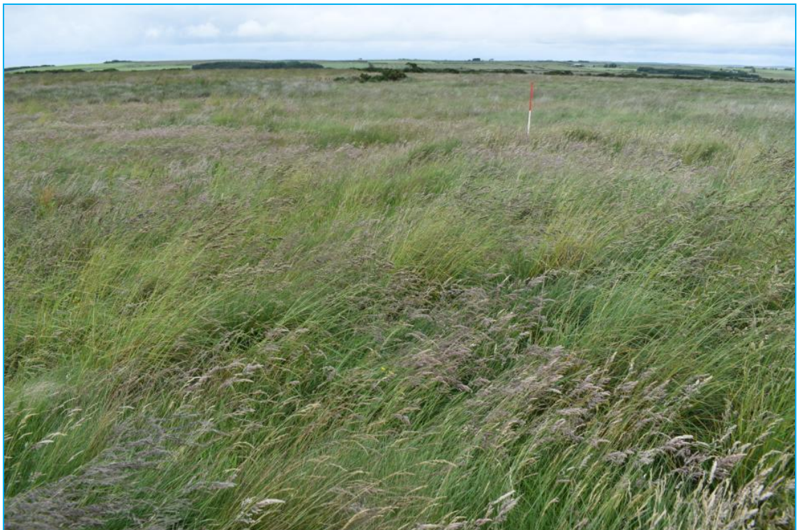
Plate 10-2-12: View northeast over building (Asset 70c) from southwest corner, ranging rod demarcating northeast corner