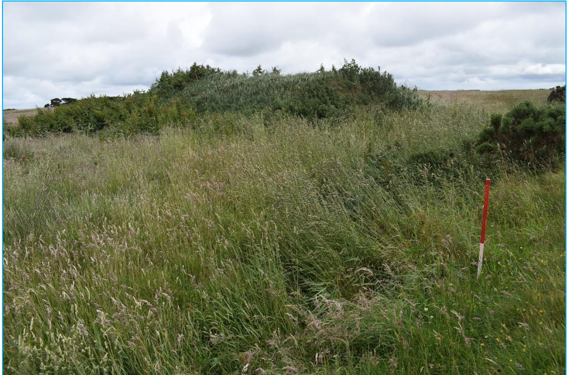
Plate 10-2-7: Spoil heap (Asset 107) under vegetation, facing southeast