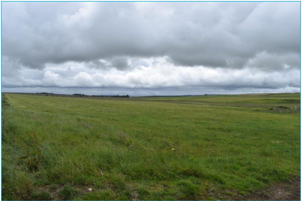
Plate 10-2-1: View south-southwest towards the southwest portion of Site, within the topographical setting of a former river valley