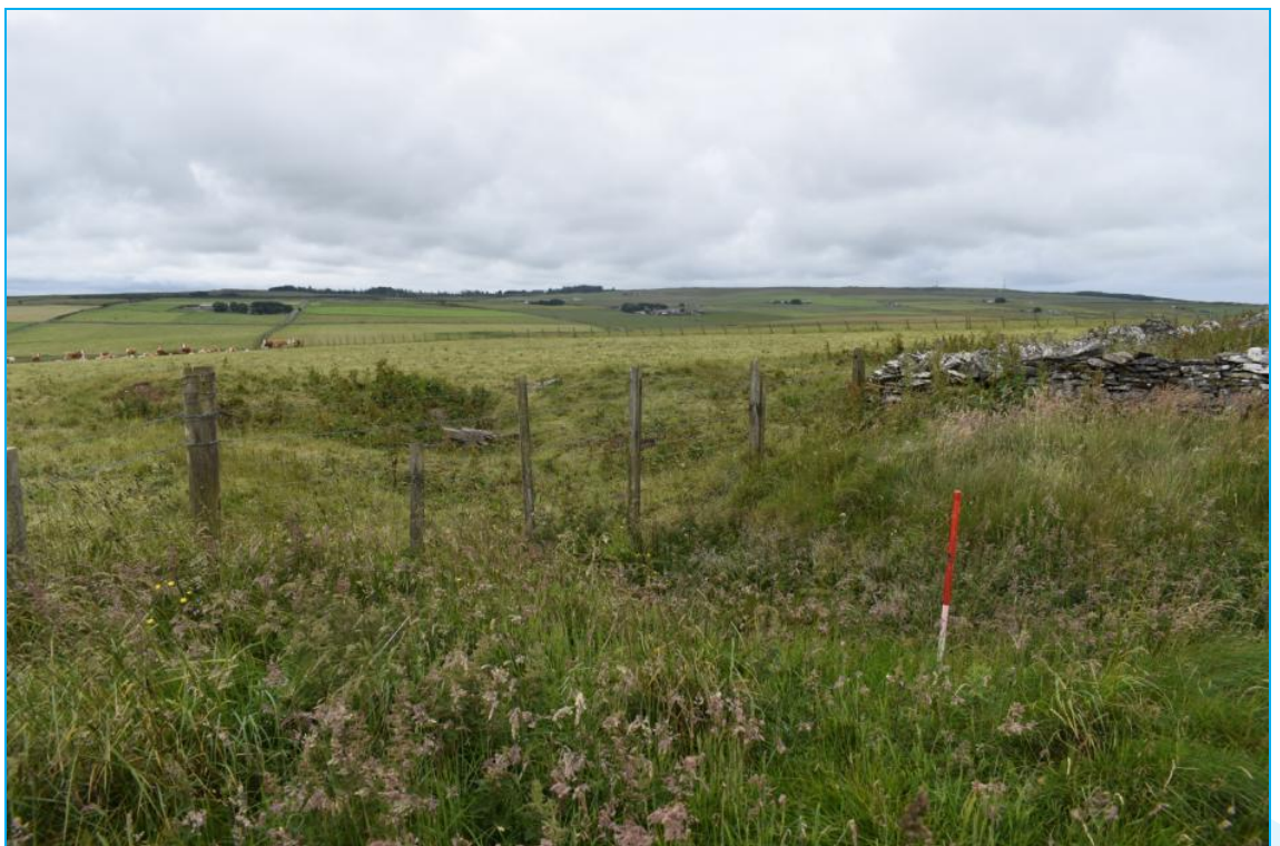
Plate 10-2-14: View northwest over quarry (Asset 96)