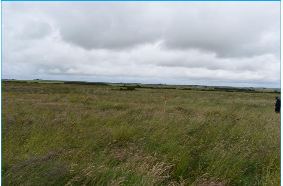
Plate 10-2-13: View northeast over building (Asset 70d) from southwest corner, ranging rod demarcating northeast corner