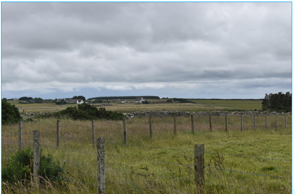
Plate 10-2-16: View southeast towards Scheduled Stone Lud (Asset 47), right of central building, from southeast boundary of the Proposed Development Site