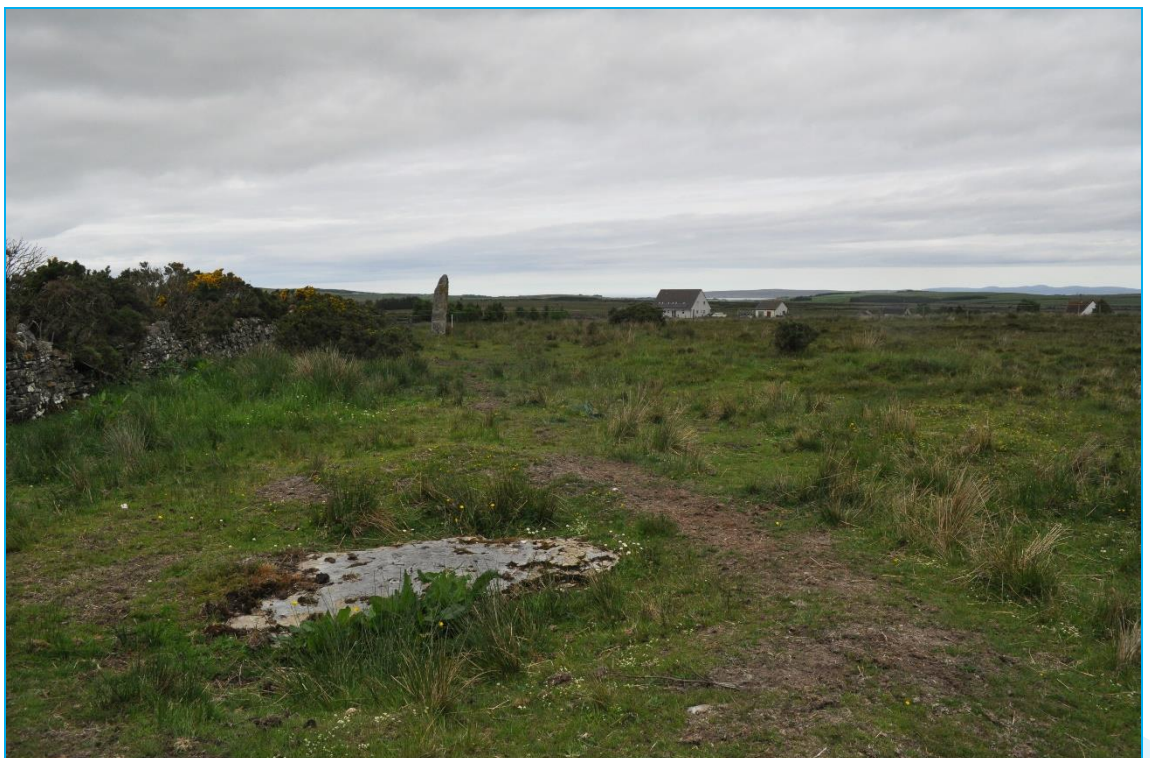
Plate 10-2-22: View northwest towards Proposed Development Site overlooking the Scheduled Stone Lud (Asset 47) recumbent stone (foreground) and standing stone (mid ground)