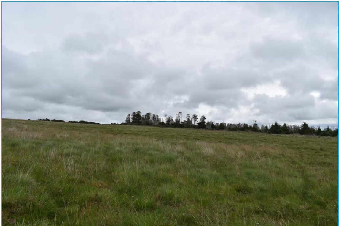
Plate 10-2-18: View southeast towards the Scheduled Stone Lud (Asset 47) with intervening forestry plantation, from near Turbine 2 location