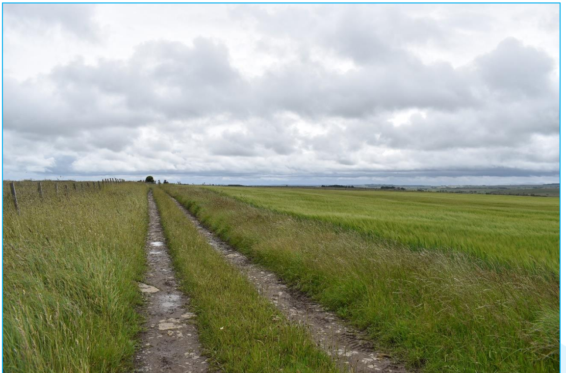
Plate 10-2-10: View southeast from Turbine 1 location towards the Scheduled Stone Lud (Asset 47), situated beyond (and below) intervening rise of hill