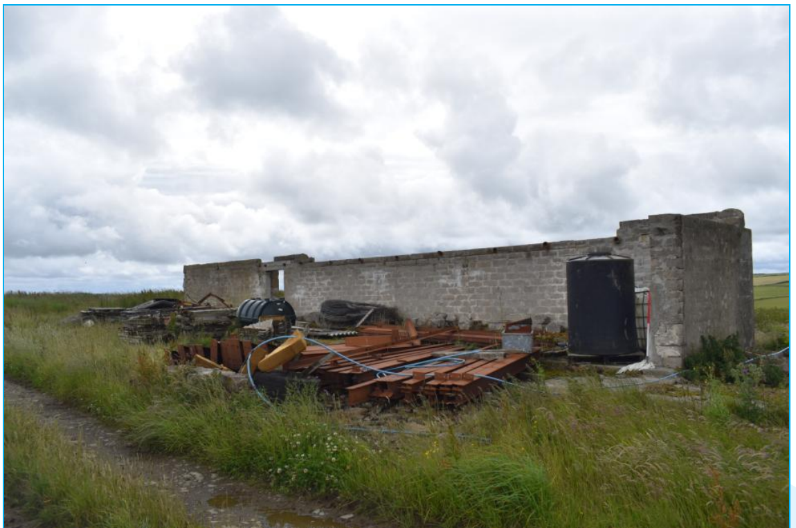
Plate 10-2-4: Modern dismantled agricultural building (Asset 104), facing southwest