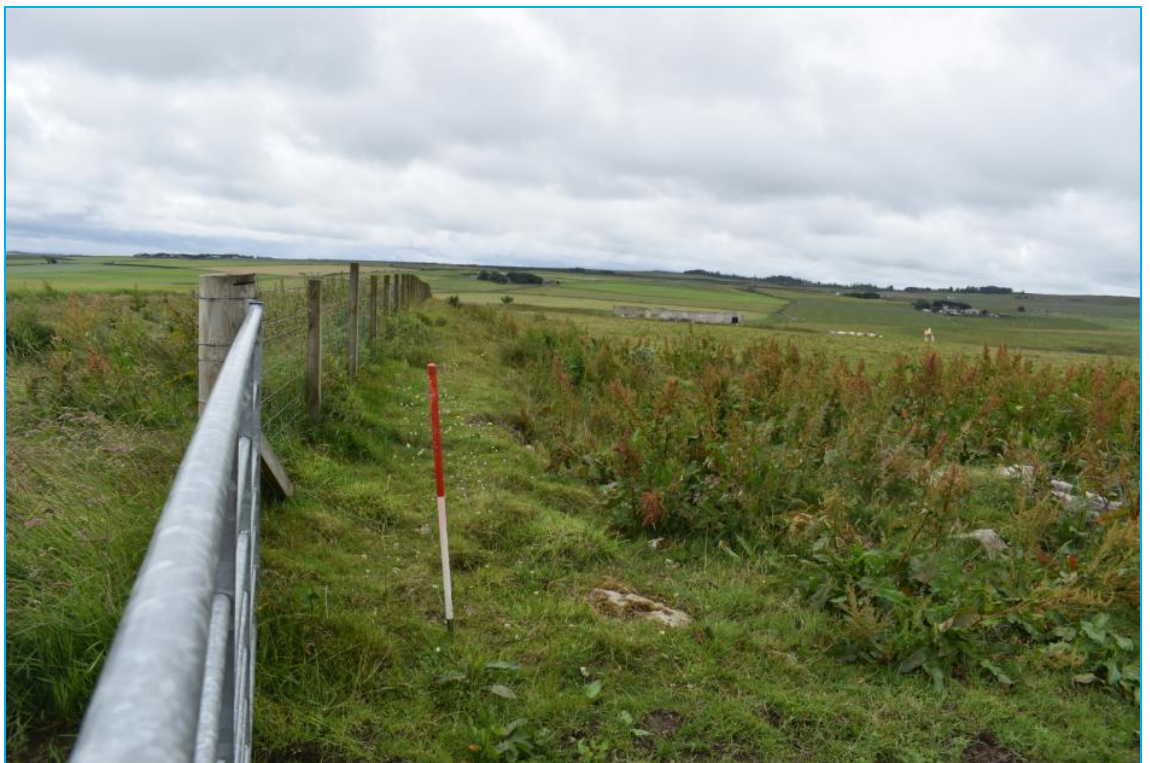
Plate 10-2-6: Drainage ditch (Asset 106) under vegetation on right of ranging rod, facing southwest