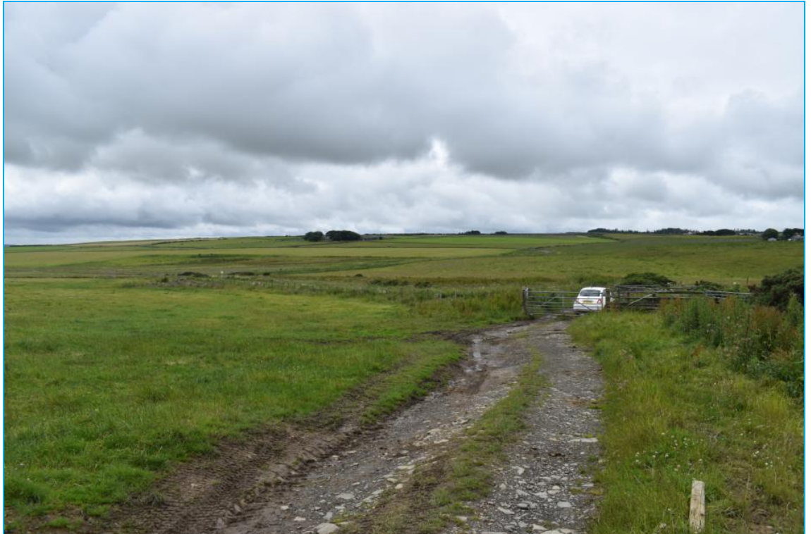
Plate 10-2-3: View over the northwest extent of the Proposed Development Site with clearance cairn (Asset 103) immediately adjacent to the boundary visible in left mid-frame, facing southwest