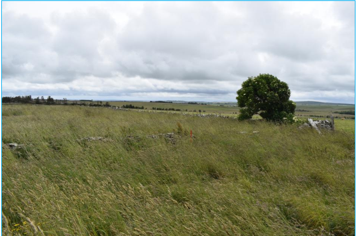
Plate 10-2-11: Drystone wall (Asset 70a), facing southwest