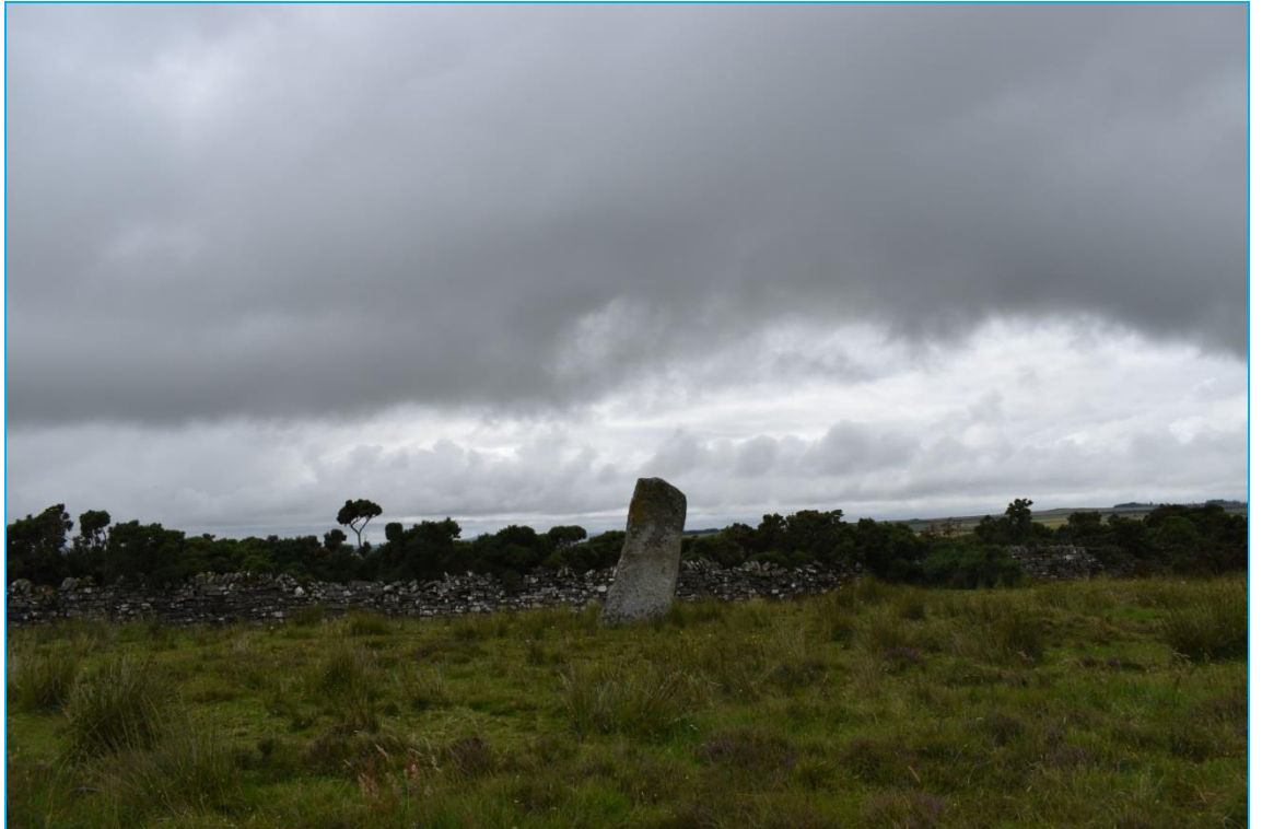
Plate 10-2-23: View southwest overlooking the Scheduled Stone Lud (Asset 47) standing stone, illustrating the screening effect of the drystone wall and gorse on southerly views