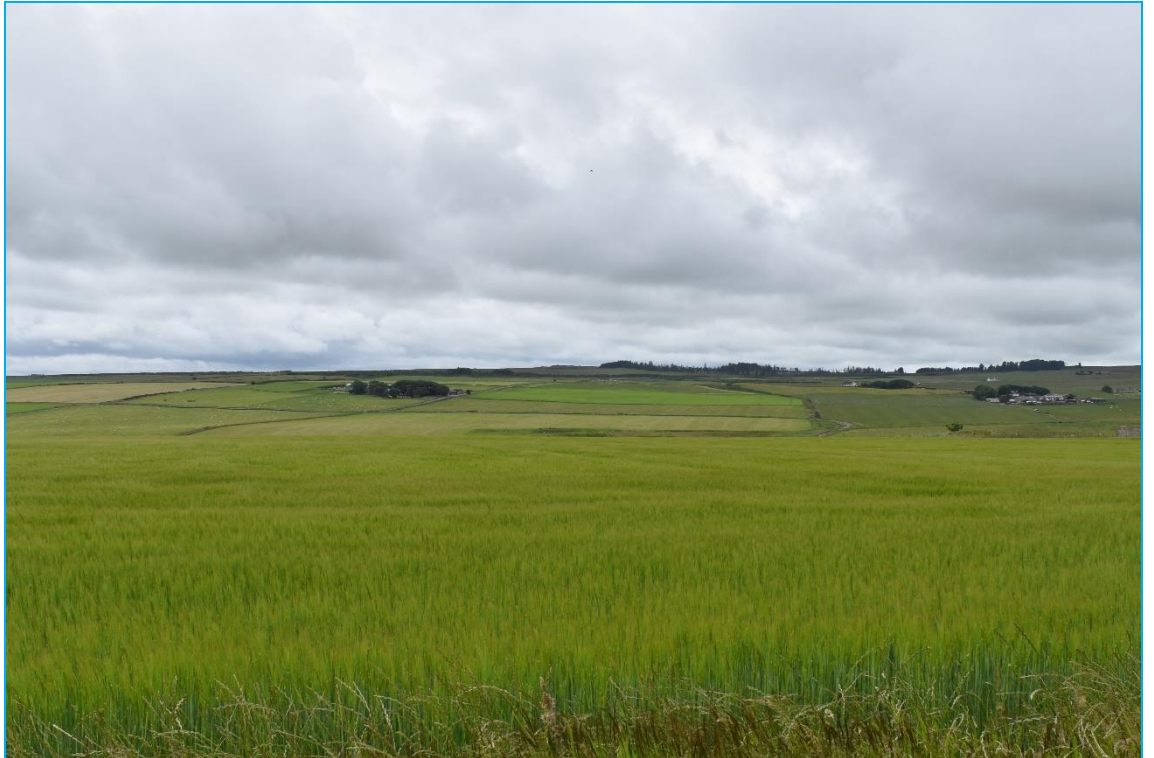
Plate 10-2-9: View west from Turbine 1 location towards the Scheduled Stemster long cairn (Asset 9), visible in mid-frame skyline as low mound framed by larger reservoir mound to left and commercial forestry plantation to the right