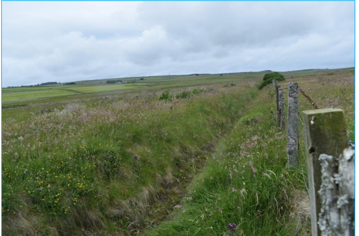
Plate 10-2-19: Drainage ditch (Asset 110), facing north-northwest