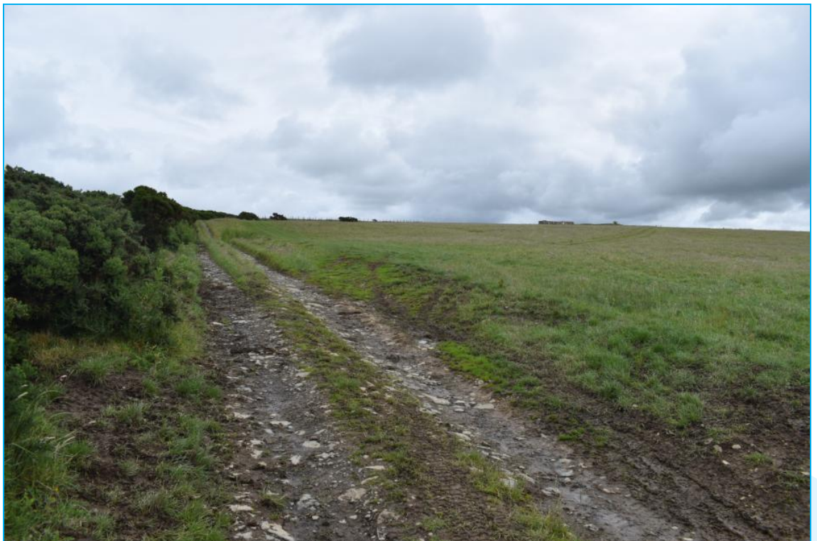
Plate 10-2-2: View over existing track, facing east