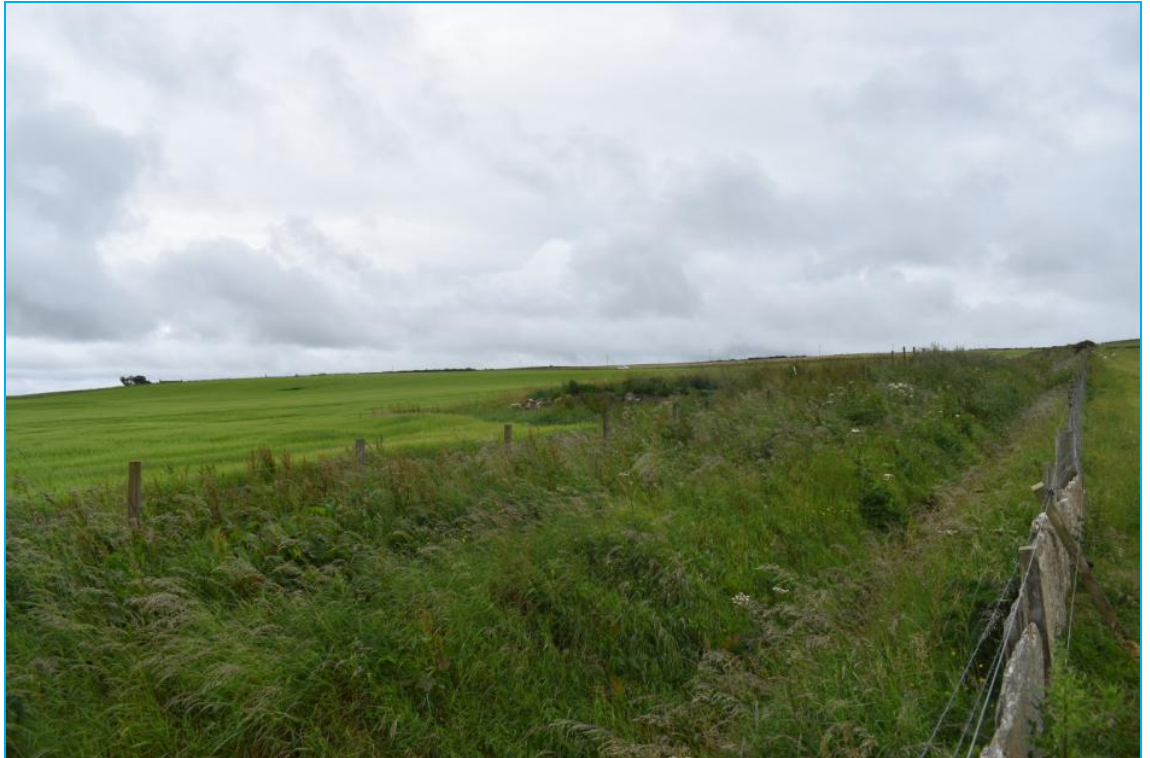
Plate 10-2-21: View over probable clearance cairn (Asset 113), facing southwest