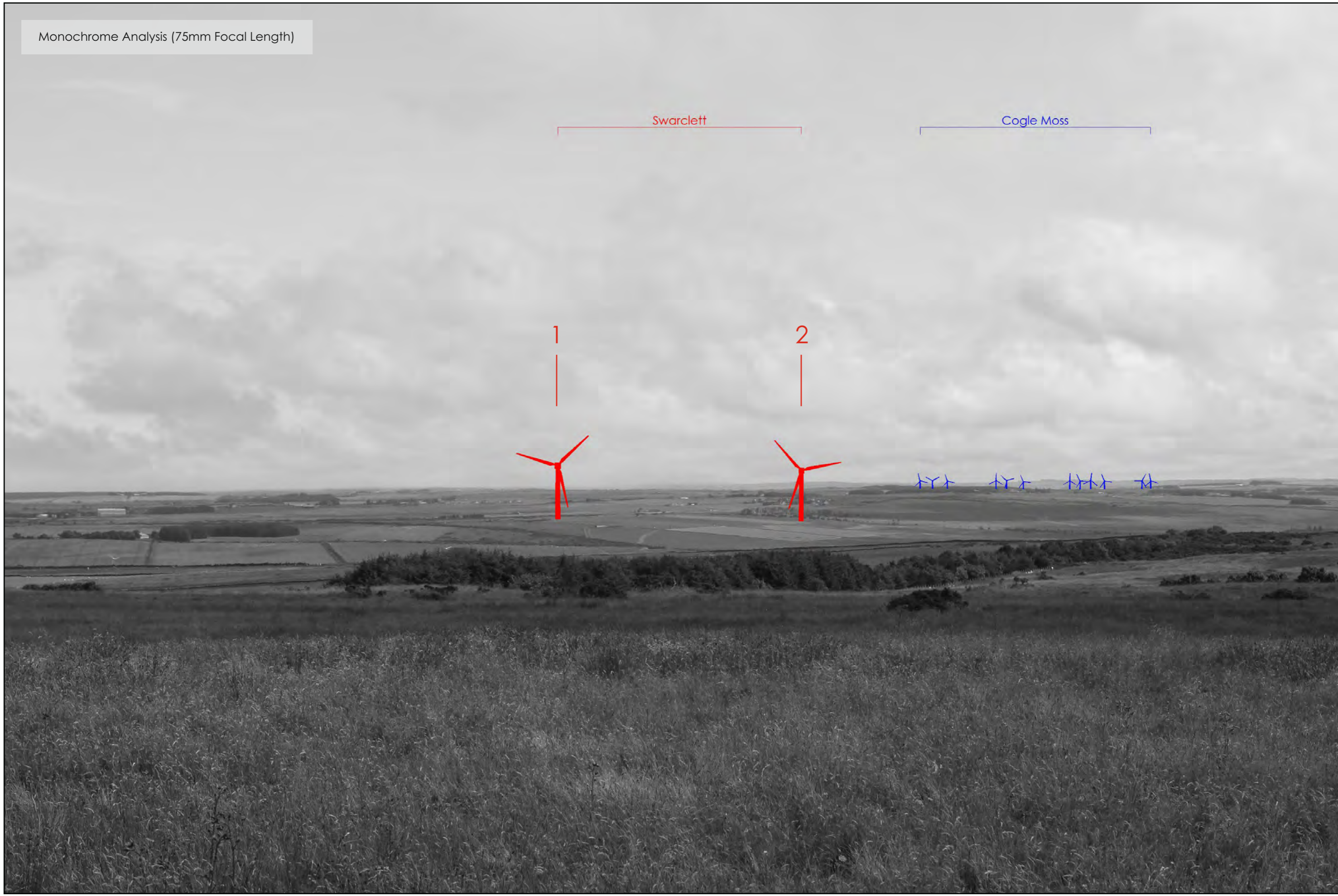
This image should be viewed at a comfortable arm's length (approx. 500mm)