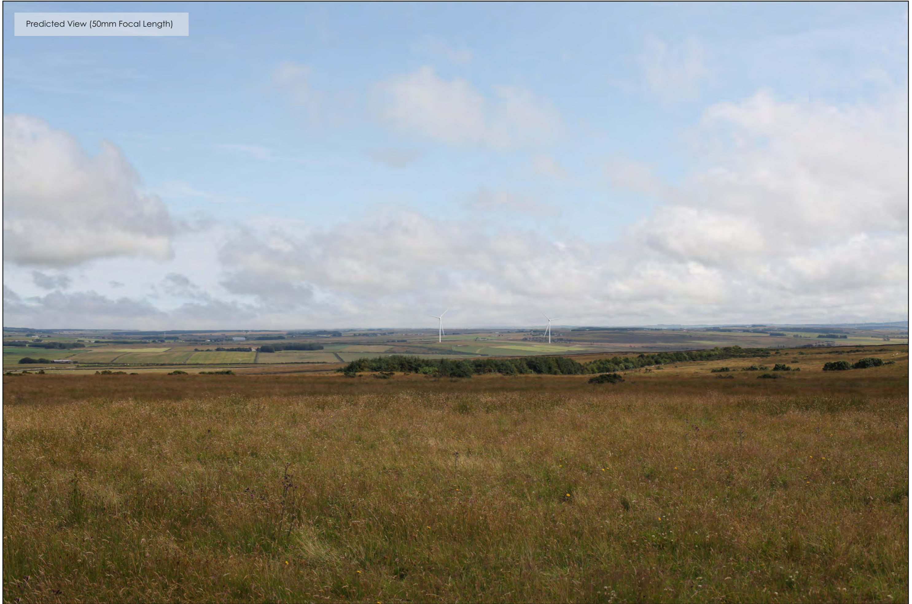
When viewed at a comfortable arms length (approx. 500mm), this printed image is representative of our detailed central vision, but is not representative of scale and distance.